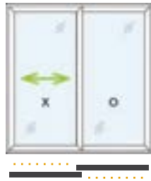
2 Pane Style OX/XO