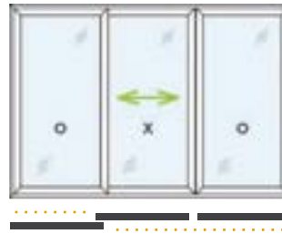
3 Pane Style OXO