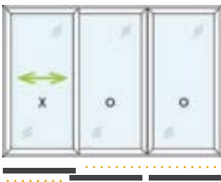
3 Pane Style XOO/OOX