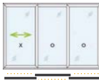
3 Pane Style XOO/OOX (Optional)