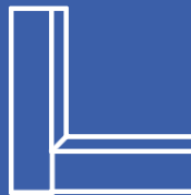
Timberweld® Joint Heritage Look