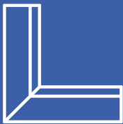
Welded Joint Modern Look