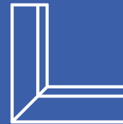
Welded Joint Modern Look